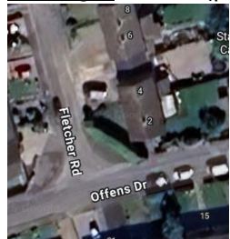
Bottom of Fletcher Rd