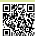
Facebook Staplehurst Parish Council