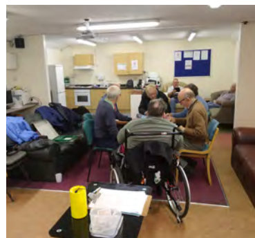
Youth Club after

The Staplehurst Shed has been running for seven years, and many early members are still involved. However, we are keen to welcome new members. So, if you want some conversation, a bit of banter, or just to get out of the house for a few hours each week, why not come