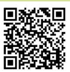
Parish Council Website

For more information visit: www.staplehurst-pc.uk