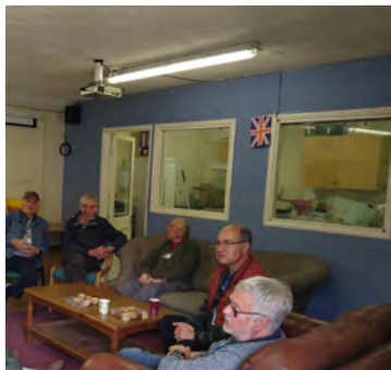
Youth Club before

The Shed exists as a place where men come together to socialise, make new friends, play pool and scrabble, share ideas and skills, and participate in practical projects. Tea and coffee are provided. Current