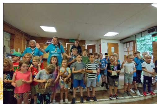
Squirrel & Beaver 'Badgefest'