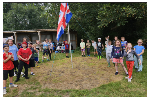
Scout & Cub Summer Camp 2024

Find out more and get in touch at our website www.staplehurstscouts.org.uk or on any of our section's Facebook pages.