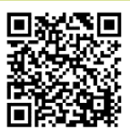
Parish Council Website

For more information visit Web: www.staplehurst-pc.uk